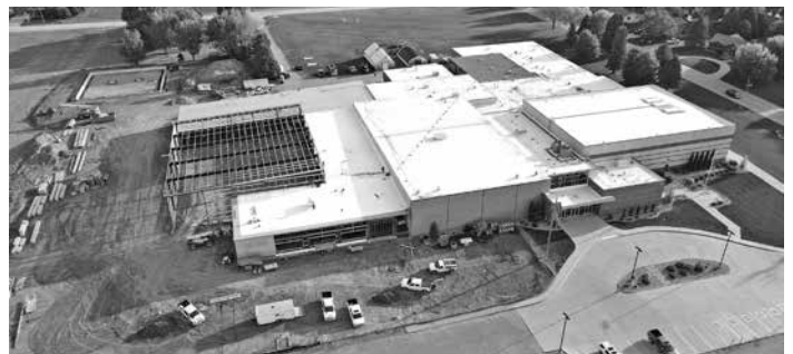
The building project begins to take shape.