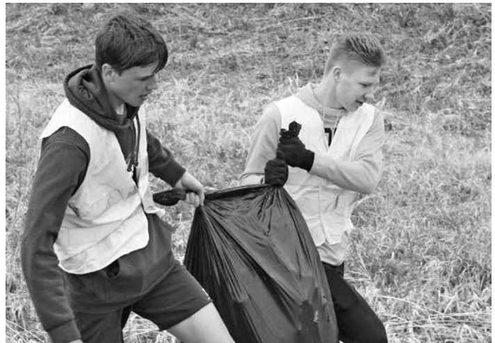
The Unity student body and faculty/staff walked many miles of ditches in our annual Clean-a-thon Day. The items found in the ditches create great storytelling the next day. Not only do our Sioux County ditches get cleaner, we also raise over $50,000 dollars for our general fund. Thanks to all who participated in walking and giving!