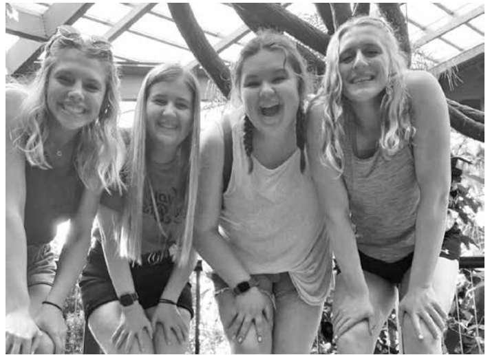
Several Senior girls enjoyed their class trip to Omaha.