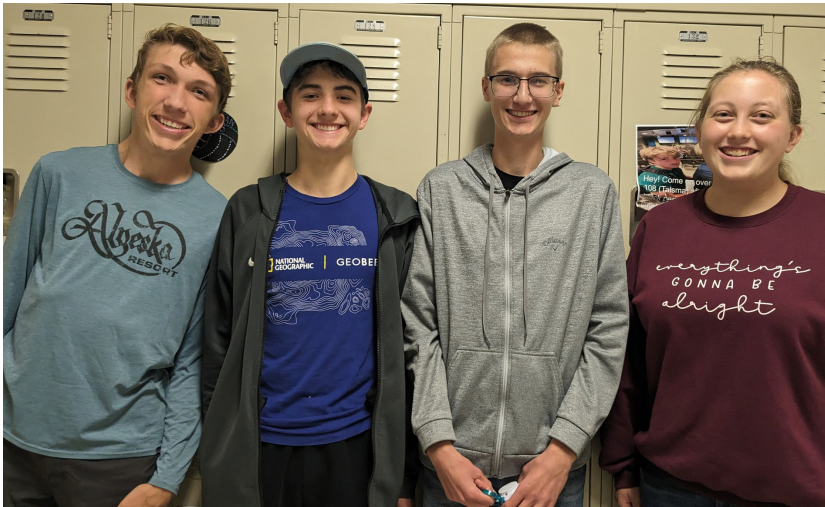
1st Place Varsity Quiz Bowl Team at our home meet.