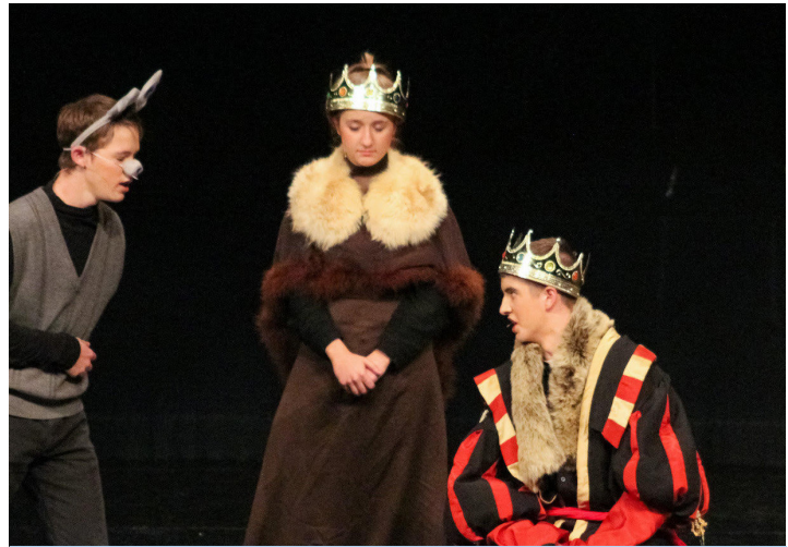
The King, Queen, and Donkey discuss the King's bad breath in the one act.