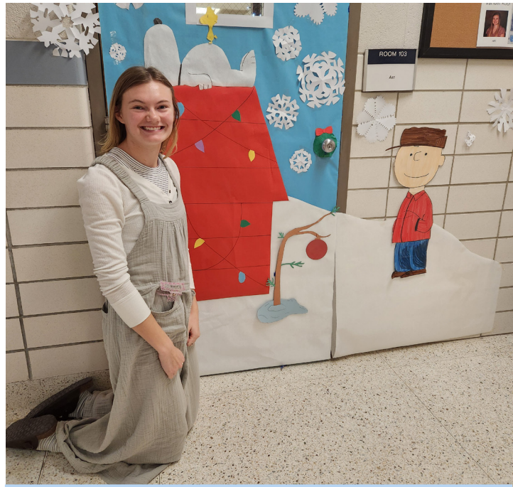
The Living Groups added some Christmas joy to our halls by decorating various classroom doors.