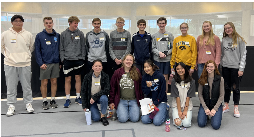
The team that competed at the Dordt Math Challenge.