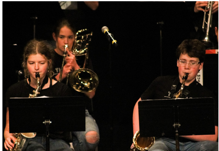
Jazz Band players have rhythm.