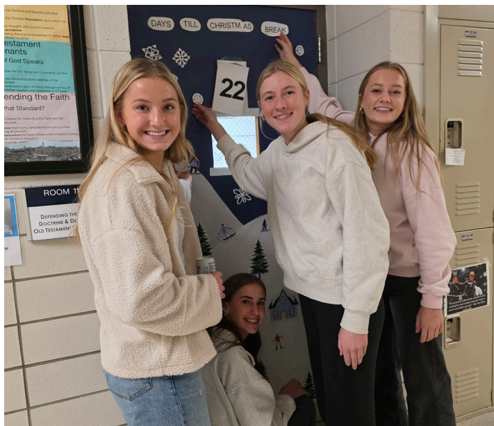
Junior girls help each other deck the halls (or doors)!