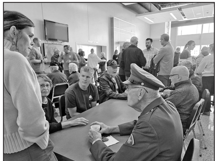
Faculty and students visited with the Veterans after our program.