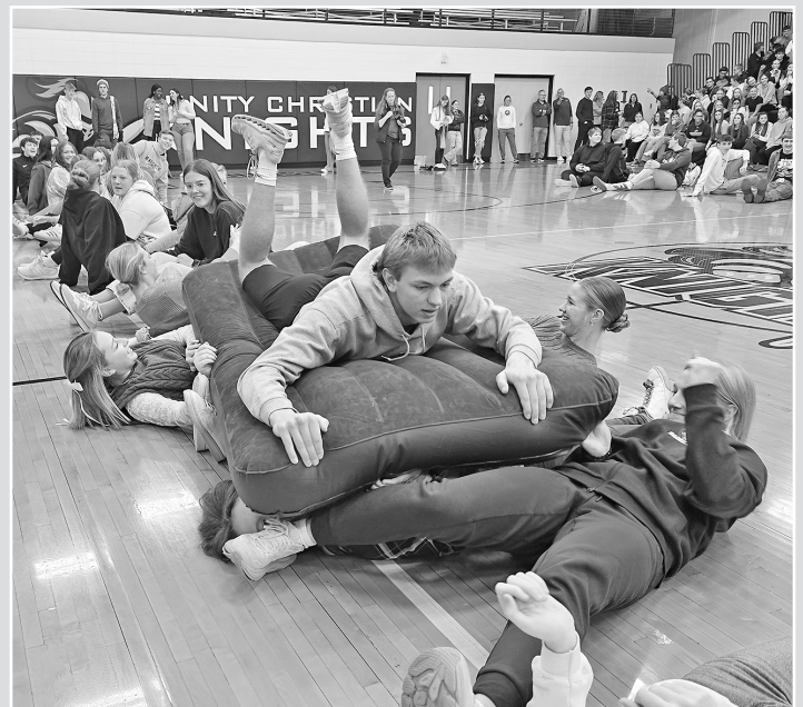
Western and Unity student councils planned mixer games that we played in the two gyms.

We have a wonderful group of leaders this year committed to serving the student body at Unity Christian. These leaders demonstrate a desire to grow the collective community at Unity by upholding some of our student body's favorite traditions, like decorating walls in the Courtyard during homecoming week, and thinking of new ways and events to engage our entire school in community. In particular, the Student Council is excited to bring back the Unity talent show during homecoming week this year.