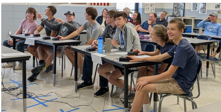
Quiz Bowl in action!