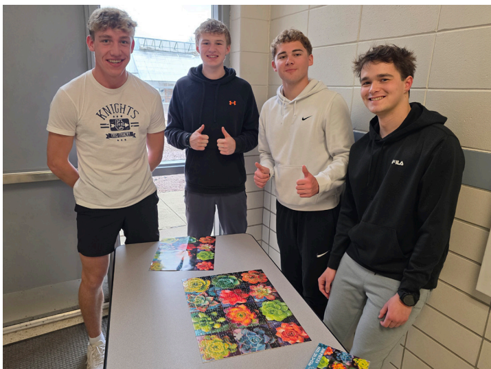
These senior guys are proud of their completed puzzle!