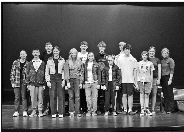
The One Act Cast

Next, Combo Night showcased local student talent from our place, NW Iowa! Two bands, filled with Unity students, shared their musical talents between the one-act drama and the improv group. “The Girlists” and “Brothers Under Tough Times” had the audience tapping their feet and clapping along to their impressive performances. The evening closed with our brave students who thought on their feet and brought silly circumstances to life through small group and larger group improv games, often gleaning audience suggestions for places and conflicts. A hearty thanks and congrats to the actors who grew in their skills and invested their time and energy. Together, we created places filled with laughter and creativity. Thanks to the many who attended, and we hope to see the rest of you join us next year!