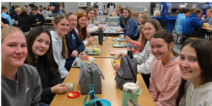
Lunch with a smile!