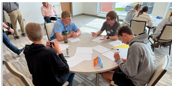
A senior group competed at Dordt's Math Competition.